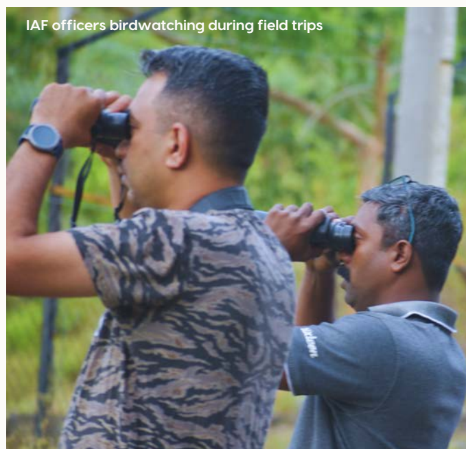
IAF officers birdwatching during field trips

The program commenced with an inaugural session, which provided insights into the significance of the training and its relevance to the Indian Air Force.