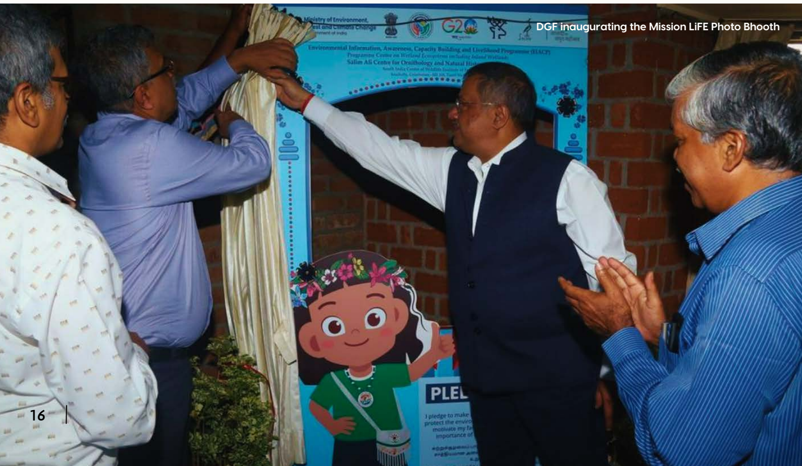
DGF inaugurating the Mission LiFE Photo Bhooth

SACON EIACP organised a Mission LiFE awareness drive at the Regional Science Centre, CIT College, Coimbatore junction targeting the general public, school children, and college students.