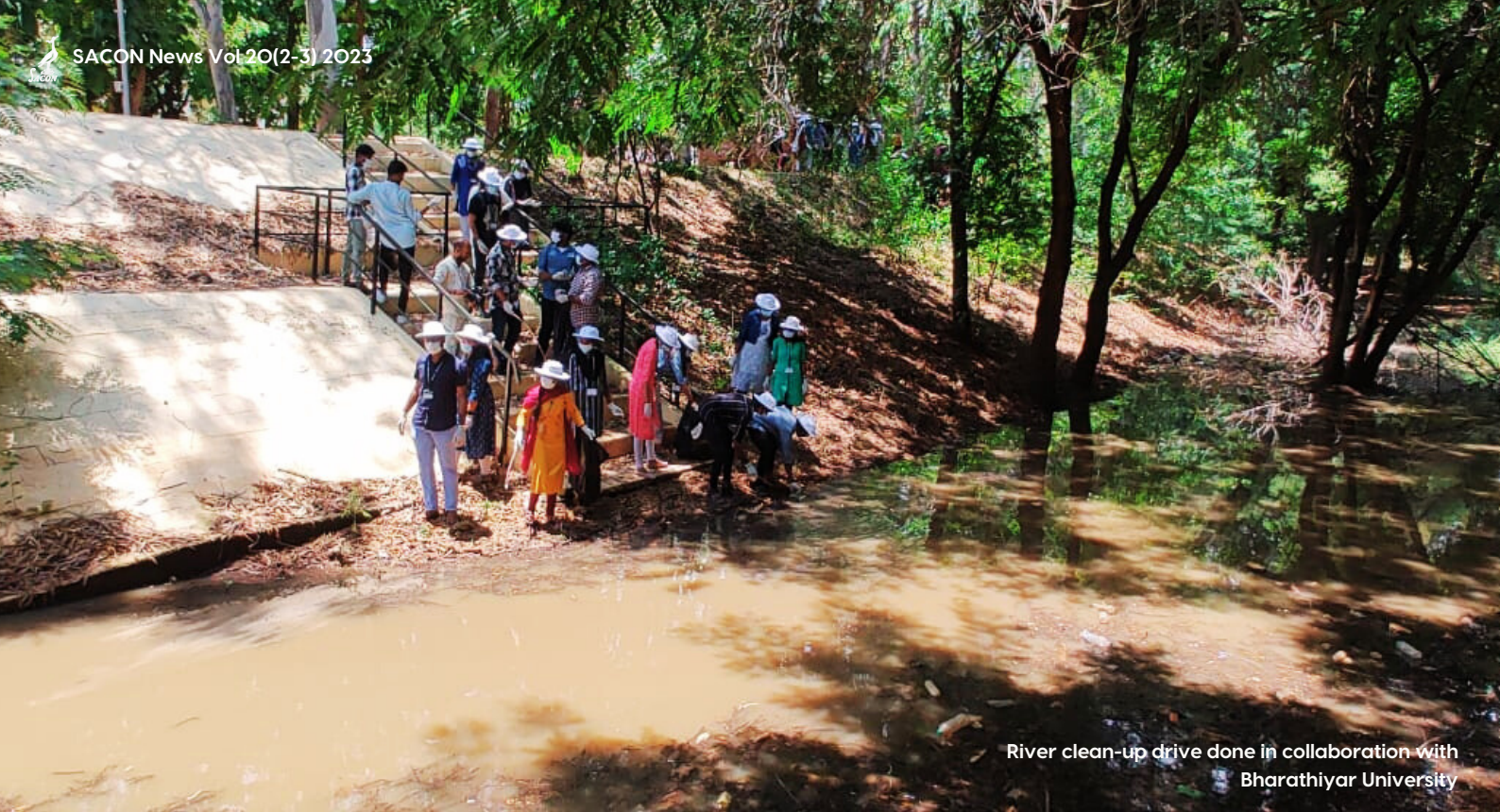
River clean-up drive done in collaboration with Bharathiyar University