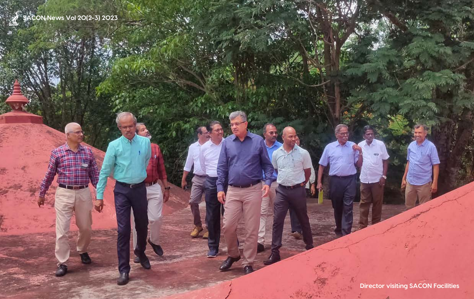
Director visiting SACON Facilities