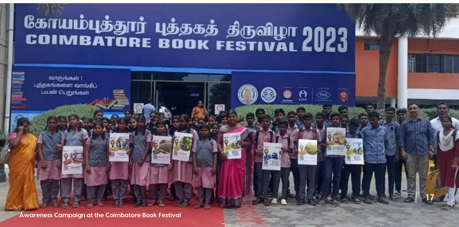
Awareness Campaign at the Coimbatore Book Festival

Mission LiFE awareness activities were also conducted for 131 students and 59 staff of Aditya Vidyashram Gurugram School, Coimbatore, who visited SACON as part of the Nature Education Programme from 21 to 23 August 2023. The team briefed about the lexicon of LiFE and disseminated the seedball pen & pencil kit and other Mission LiFE awareness materials to the students and staff.