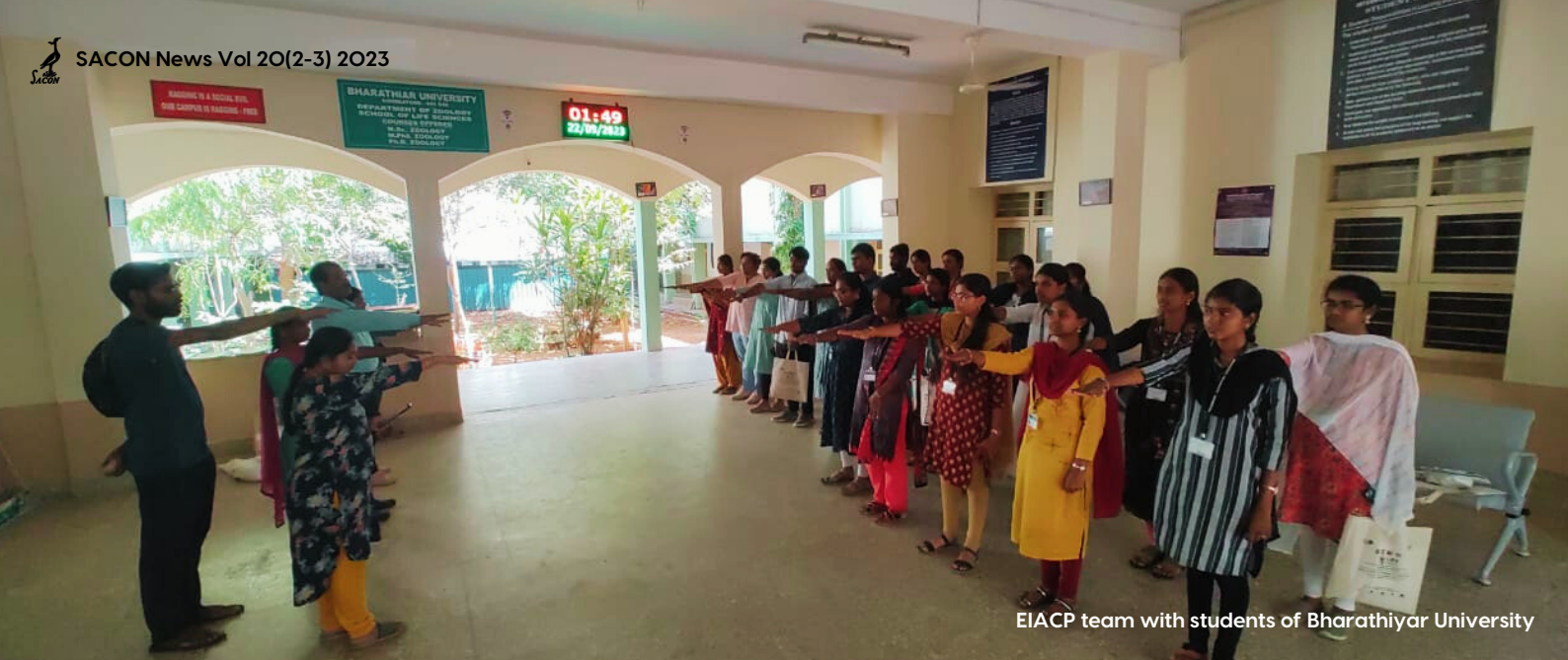
EIACP team with students of Bharathiyar University

The SACON EIACP team conducted awareness sessions for the Government school students who took part in the Coimbatore Book Festival, for the faculties of Bharathiyar University, and for the students and staff of Govt. Higher Secondary School, Valparai. The team briefed A-Z Sustainable Lifestyle Practices and also disseminated the LiFE brochures, bookmarks, and EIACP Newsletters. In addition to this, an Elocution competition was also conducted for the students of Govt. Higher Secondary School, Valparai on the topic "Adapting Sustainable Practices in Day-to-day life" in which 250 members participated.