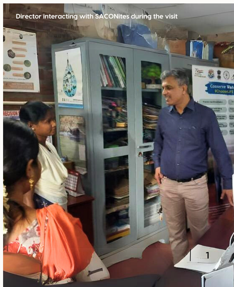
Director interacting with SACONites during the visit