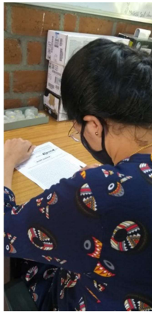
Researchers participation in the puzzle