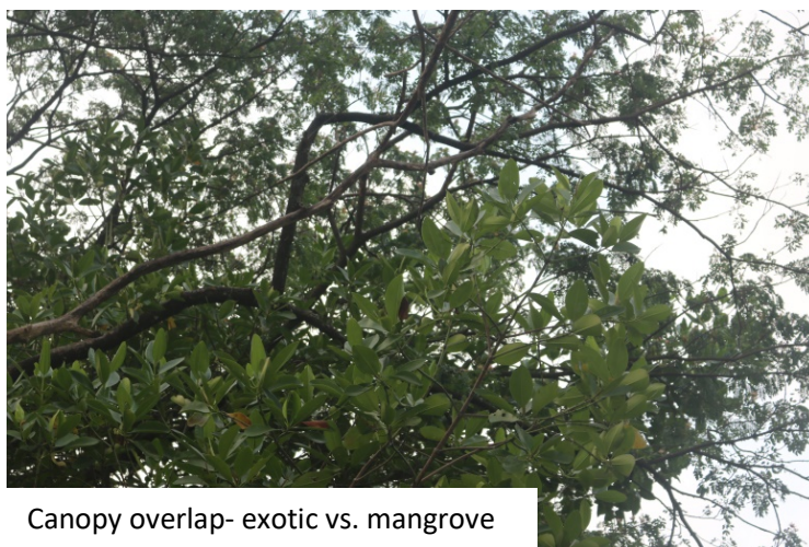
Canopy overlap- exotic vs. mangrove

Mangalavanam, being located in the heart of the biggest urban conglomerations in the state of Kerala, has several management issues and threats to its environment. Some of the key issues are heavy siltation of tidal lake, disturbance from movement of people and vehicles, high-rise buildings around the Sanctuary, canopy closure and shrinkage of open waters, heavy pollution of tidal backwaters due to urban sewage, dumping of solid