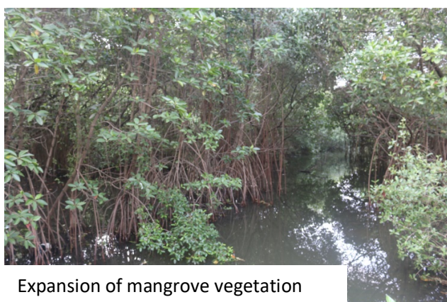
Expansion of mangrove vegetation

wastes, and oil leak from oil-tankers parked close by have already been identified in earlier studies (Jayson, 2001; Karunakaran et al 2015). Decades of development activities carried out in the vicinity of the Sanctuary (Gowshree & Vallarapadam Container Project) and ongoing mass scale construction