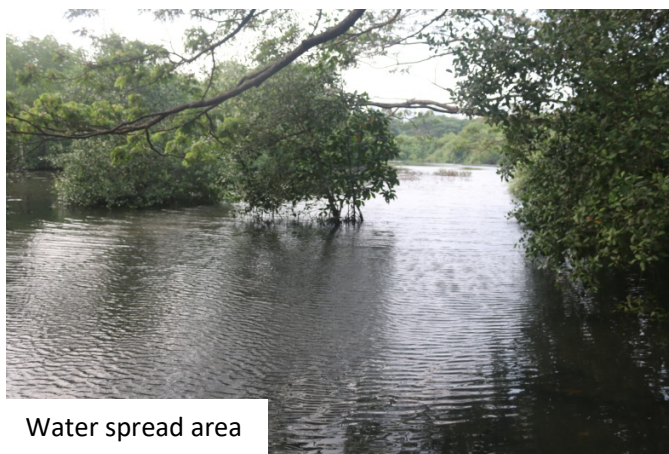
Water spread area

The physical environmental set up of the Sanctuary has drastically modified by human and natural process. The deposition of sediments from the Vembanad lake, tidal influx and sewage water from the neighbouring commercial and other establishment made drastic impact to the physical and chemical properties of the water and sediment. The litters from the nearby area increased the organic matter load (10.39 %), plying of motor boats in the nearby Lake and heavy vehicular movement in the immediate surroundings of the PA (High Court of Kerala is situated next to the PA) contributed to the high level of oil and other hydrocarbons in the samples. This may cause the death of aquatic fauna as well as they may cover the pores of pneumatophores (breathing roots) of mangroves which can cause the death of mangrove plant if exposed for prolonged duration. The presence of this devastating chemical may reduce the diversity of flora and fauna of the Sanctuary.