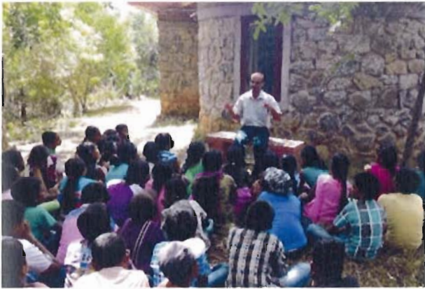
Enjoying discussion with Scientists and Research scholars