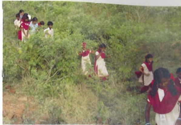
Traversing the scrub land