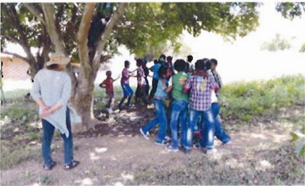
Finding relationships among the cards