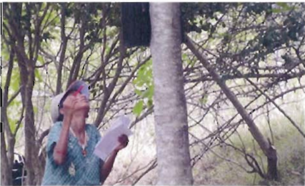
Getting acquainted with the tree