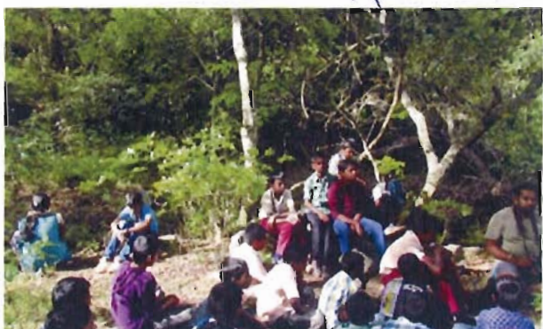
Experiencing the tranquility