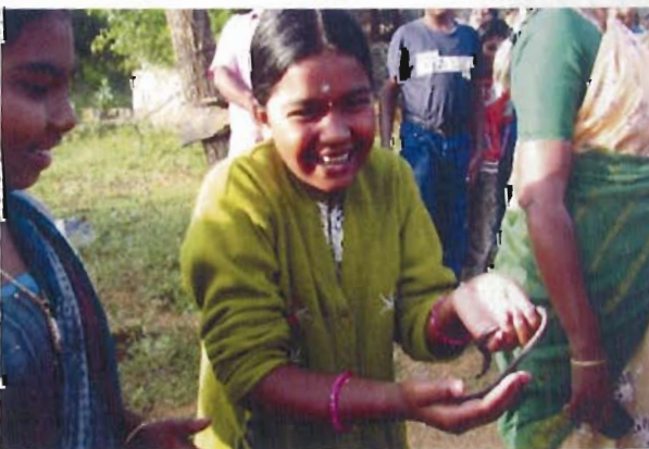
Excited to be friends with a snake