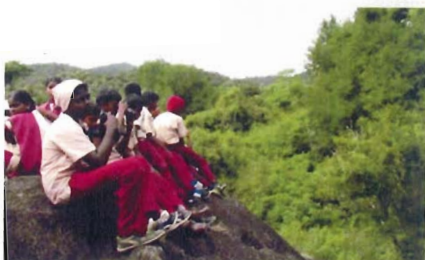
View from a rock