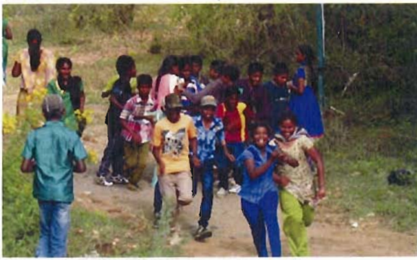
Treasure hunt begins