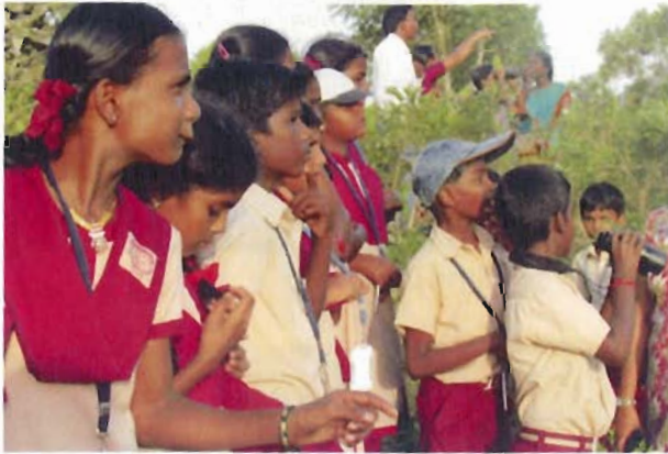
Eager to identify a bird