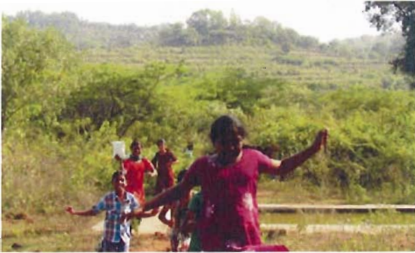
With their treasure