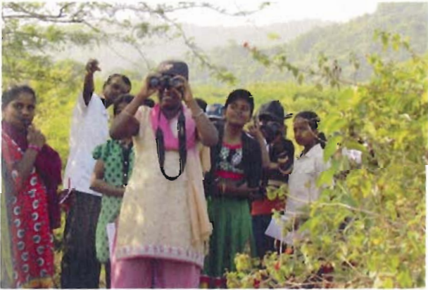
Enjoying the view from binoculars