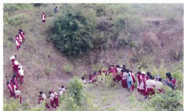
Experiencing the ups and downs