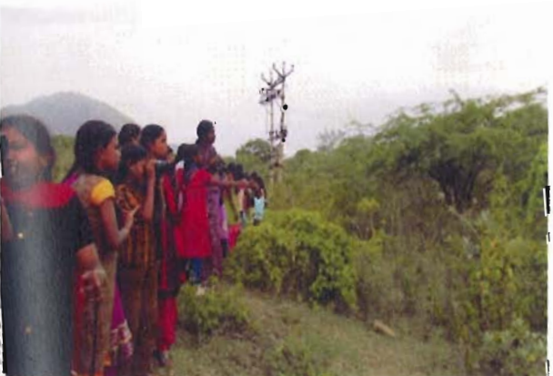
Helping a friend to spot a bird