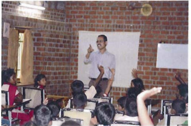
Awaiting to pose questions