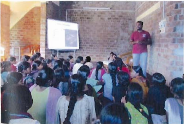
Introducing the snakes