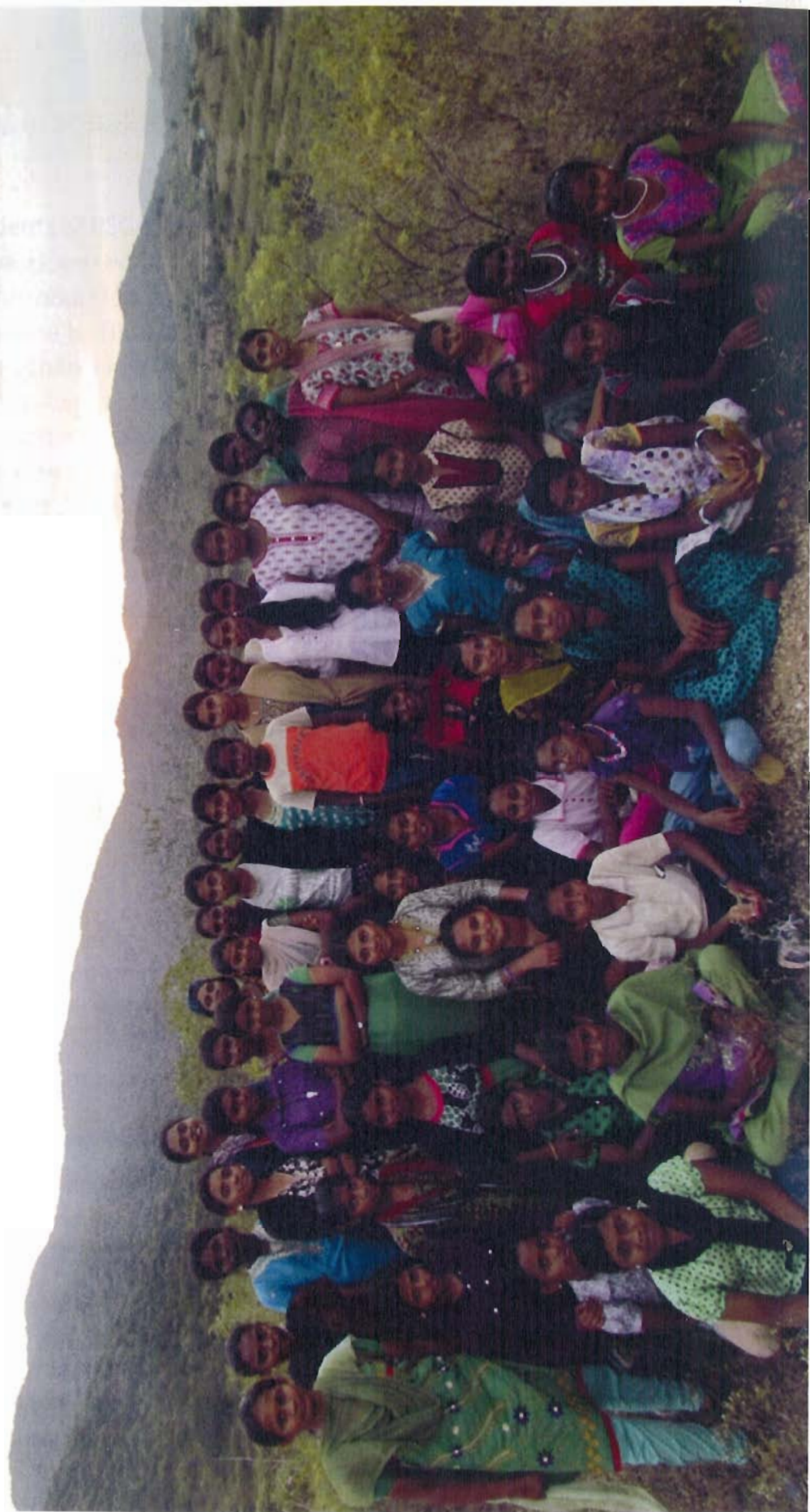
Camp 2: 7th Std PSGG Kanya Gurukulam Hr. Sec. School