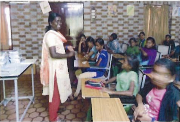
Sharing their experience