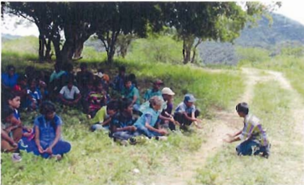
Acting, guessing and fun