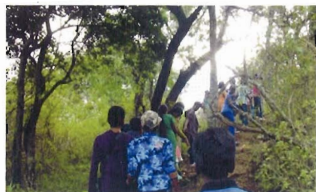
Climbing through deciduous forests