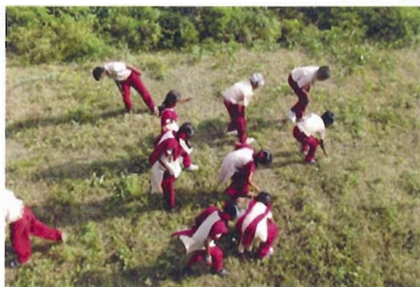
Pick an insect