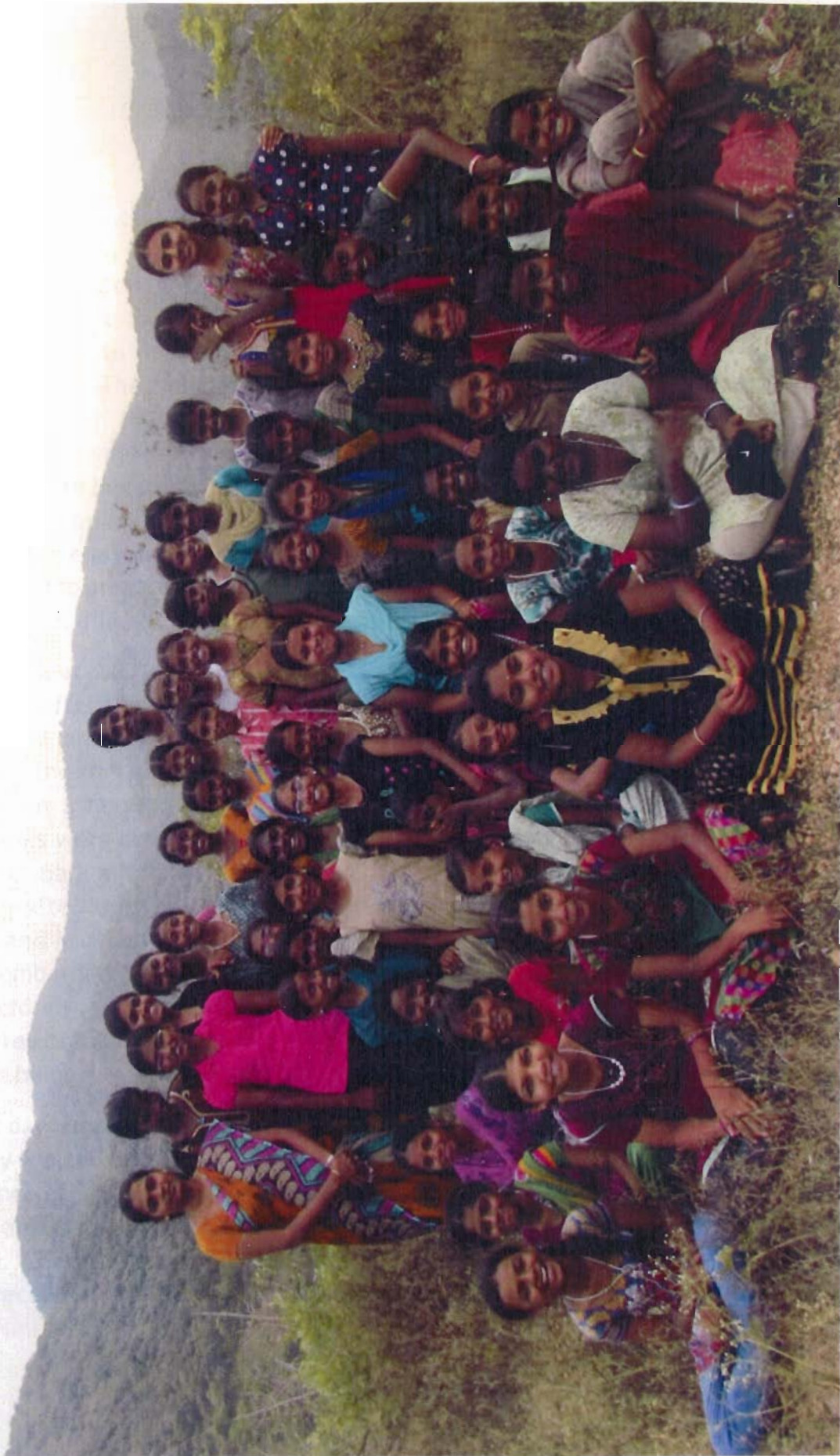
Camp 3: 8th Std PSGG Kanya Gurukulam Hr. Sec. School