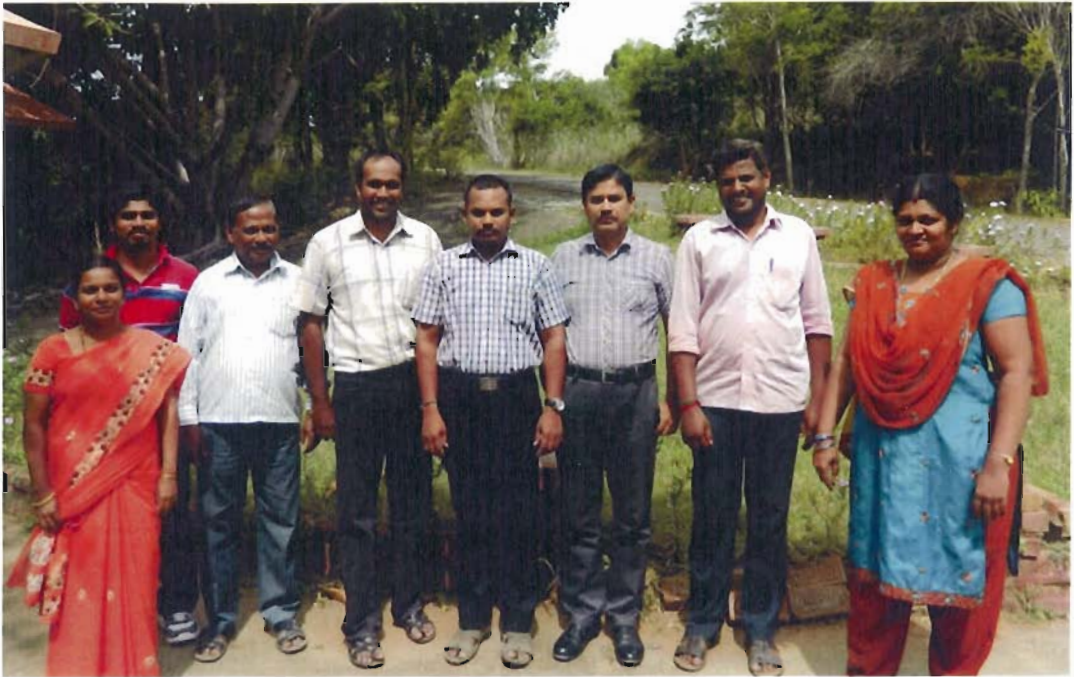
Administration and Finance Personnel of SACON