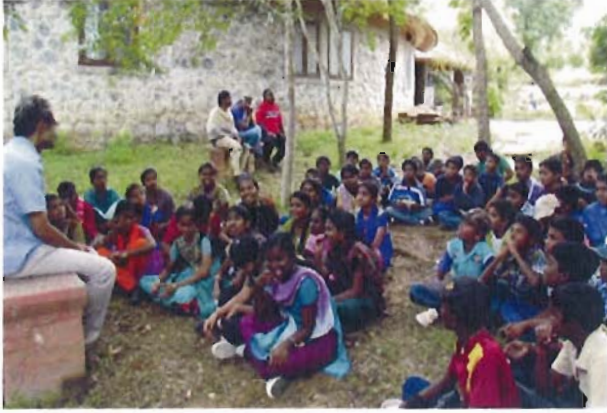
Chat with scientist