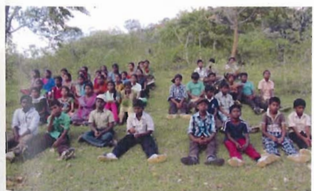
Enjoying the sounds in the evening