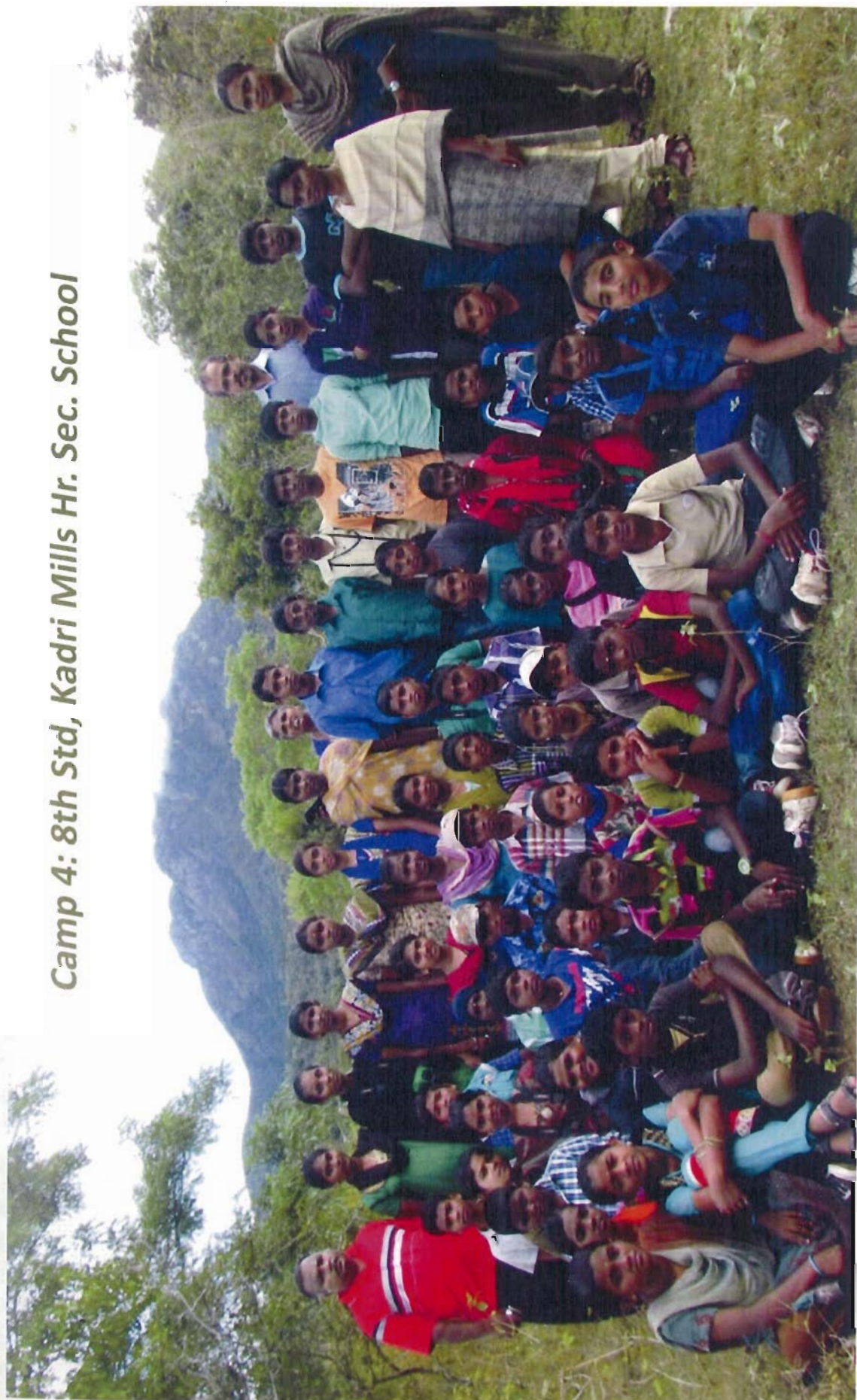
Camp 4: 8th Std, Kadri Mills Hr. Sec. School