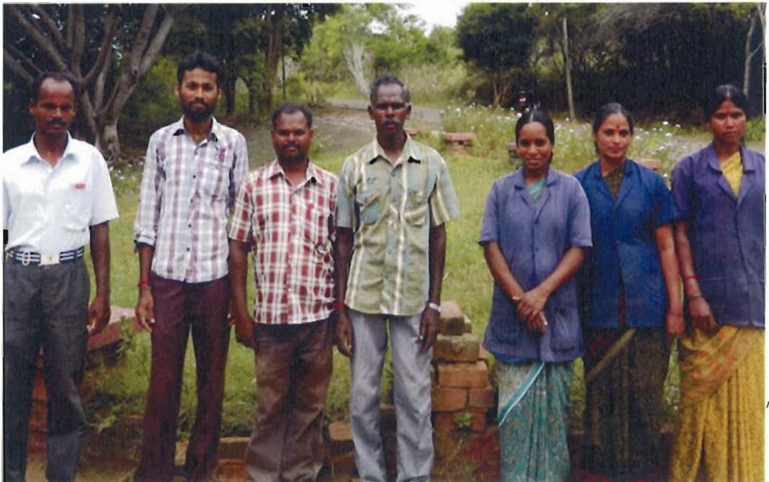
House Keeping, Security and Maintenance Staff of SACON