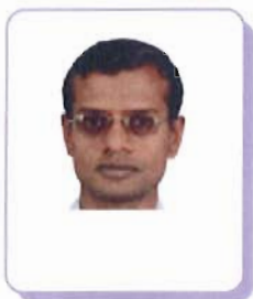
Wng Cdr Srinidhi Research Scholar SACON