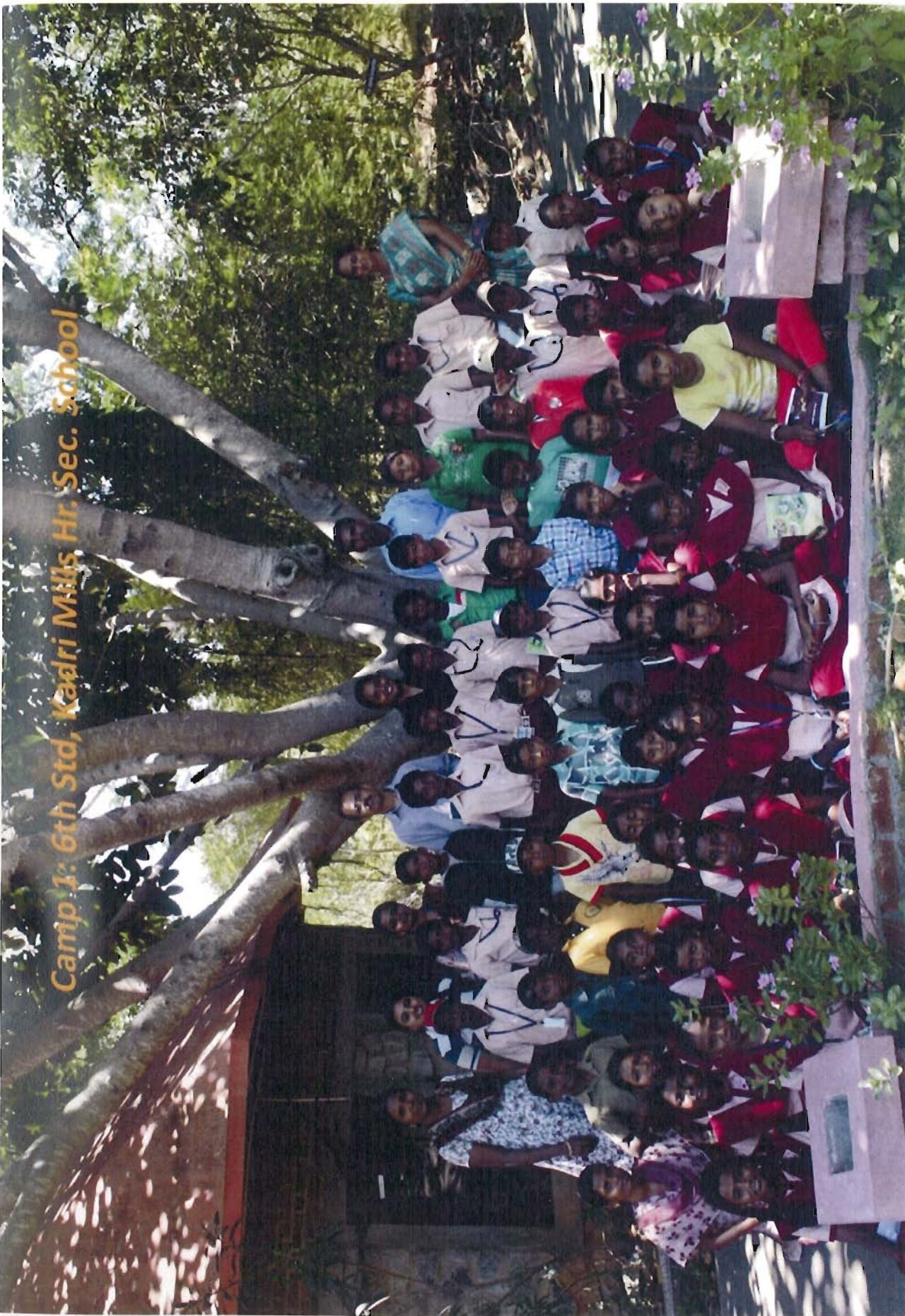
Camp 1: 6th Std, Kadri Mills Hr. Sec. School