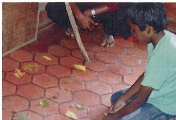
Pick and sort