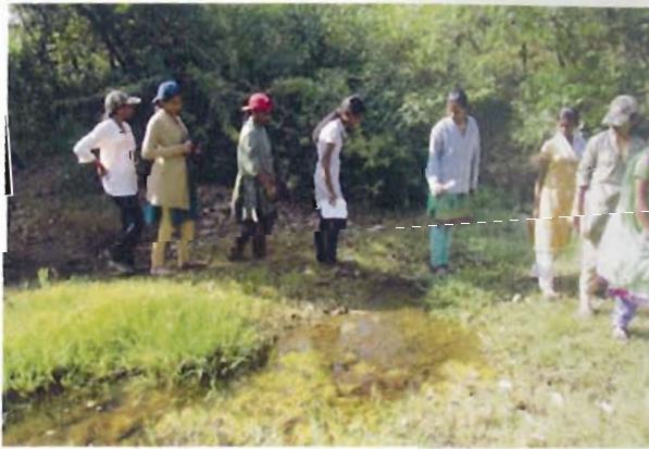
Crossing a forest stream