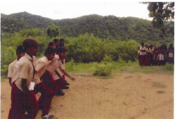
Excited to collect the 'insects'