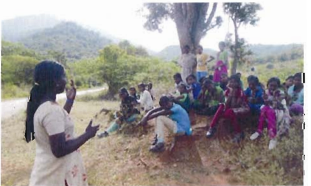
During role play