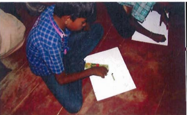
Drawing their impressions