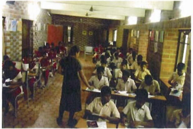
Writing feedback and post camp assessment