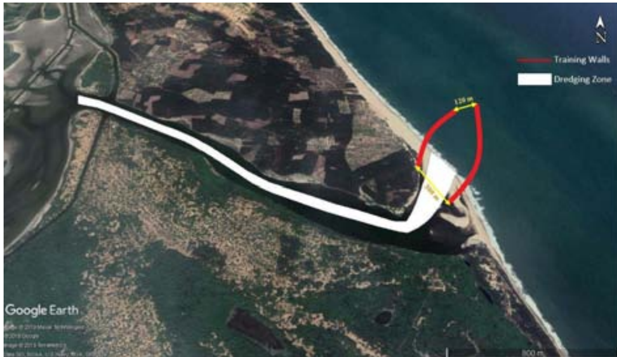
Fig 1a. The proposed dredging plan by SACON at Rayadoruvu inlet

assessments on the flora, fauna, people's livelihood and hydrological parameters in Pulicat lake for atleast one year.